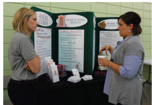
Home Nursing Services Staff tending their display